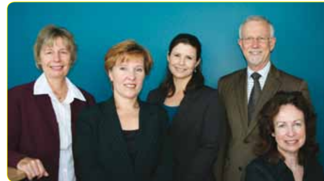
The Manningham Hearing Clinic Team

We focus on providing a thorough and professional hearing care service while keeping in touch with the latest in digital hearing aid technology.