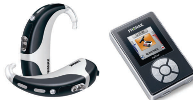
Phonak Naida Super Power BTE and MyPilot remote control

Moisture damage can be an issue in the heat of summer or with very active patients. The new super power digital hearing aids have been rigorously tested in the lab and in real life and have been proven to offer robust protection against perspiration, thanks to meticulous sealing of critical components.