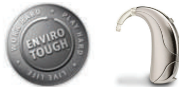
Unitron 360 Super Power BTE

The profoundly hearing impaired wear their hearing aids all day long so the design of the aid itself needs to be robust and be able to withstand a lot of "wear and tear".